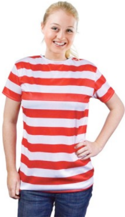
3. Balmain Stripe Jeans

Please tell your teacher or a peer student what the people are wearing in Chinese.